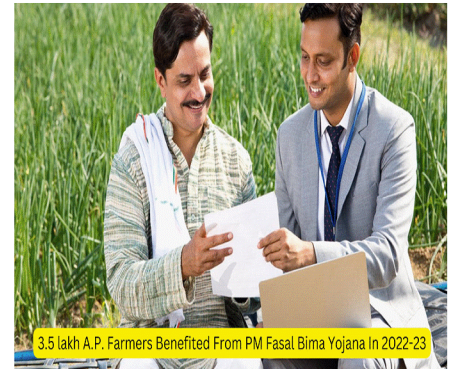
3.5 lakh A.P. Farmers Benefited From PM Fasal Bima Yojana In 2022-23